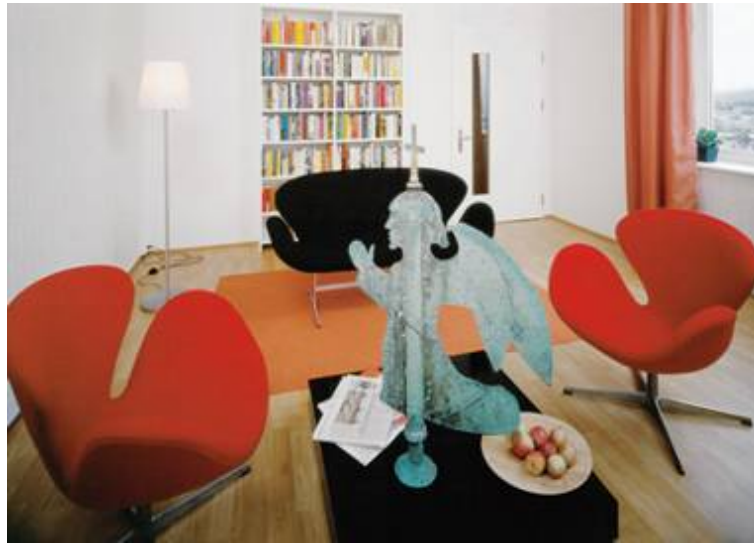
Engel 2002 Installation views, The Cathedral of Basel

Tatzu Nishi cunningly uses scale and distance in his installations to provide the audience with fresh perspectives to what might be taken for granted or otherwise seem ordinary. In one of his most important series of works, he builds rooms (often hotel rooms) around public monuments or a part of architecture. The result is two-fold. On one hand, an “instant sculpture” appears in a private space and on the other, that same piece disappears from the public sphere. Within the room, this dramatic shift from “public to private” view creates an encounter between the audience and the piece of sculpture that is simultaneously fascinating and uncanny, forcing the viewer to experience the object in a very different way. There is egalitarianism in the artist’s desire to expose art to all. Born in Nagoya and working out of Berlin, Nishi has exhibited extensively in Europe and Japan and in more recent years, in South America and Australia.