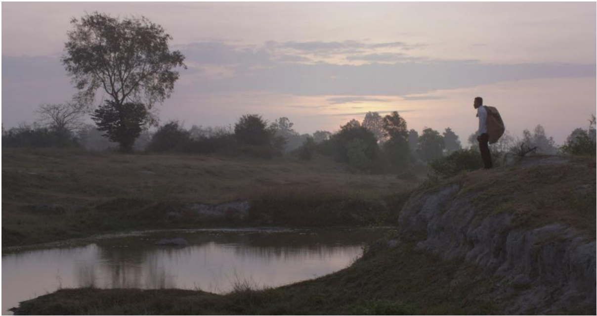
Funeral