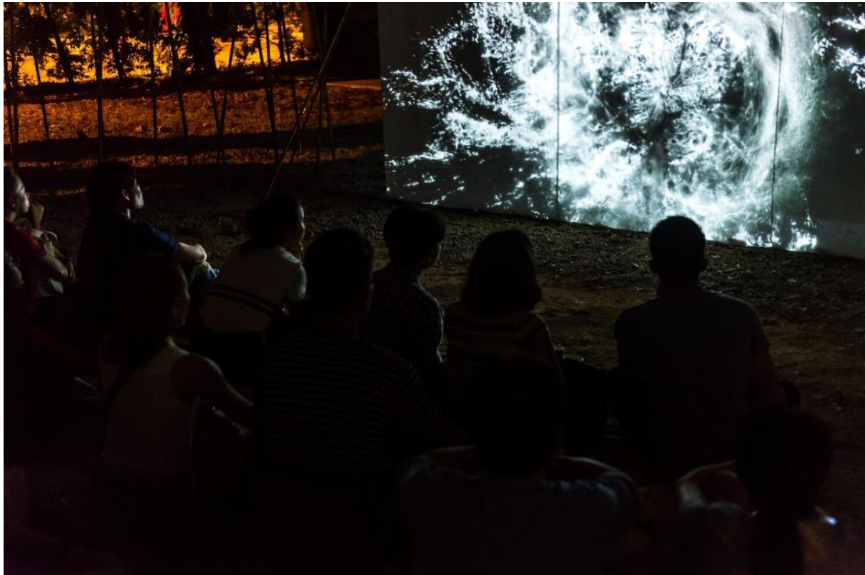
Zai Tang - Escape Velocity II